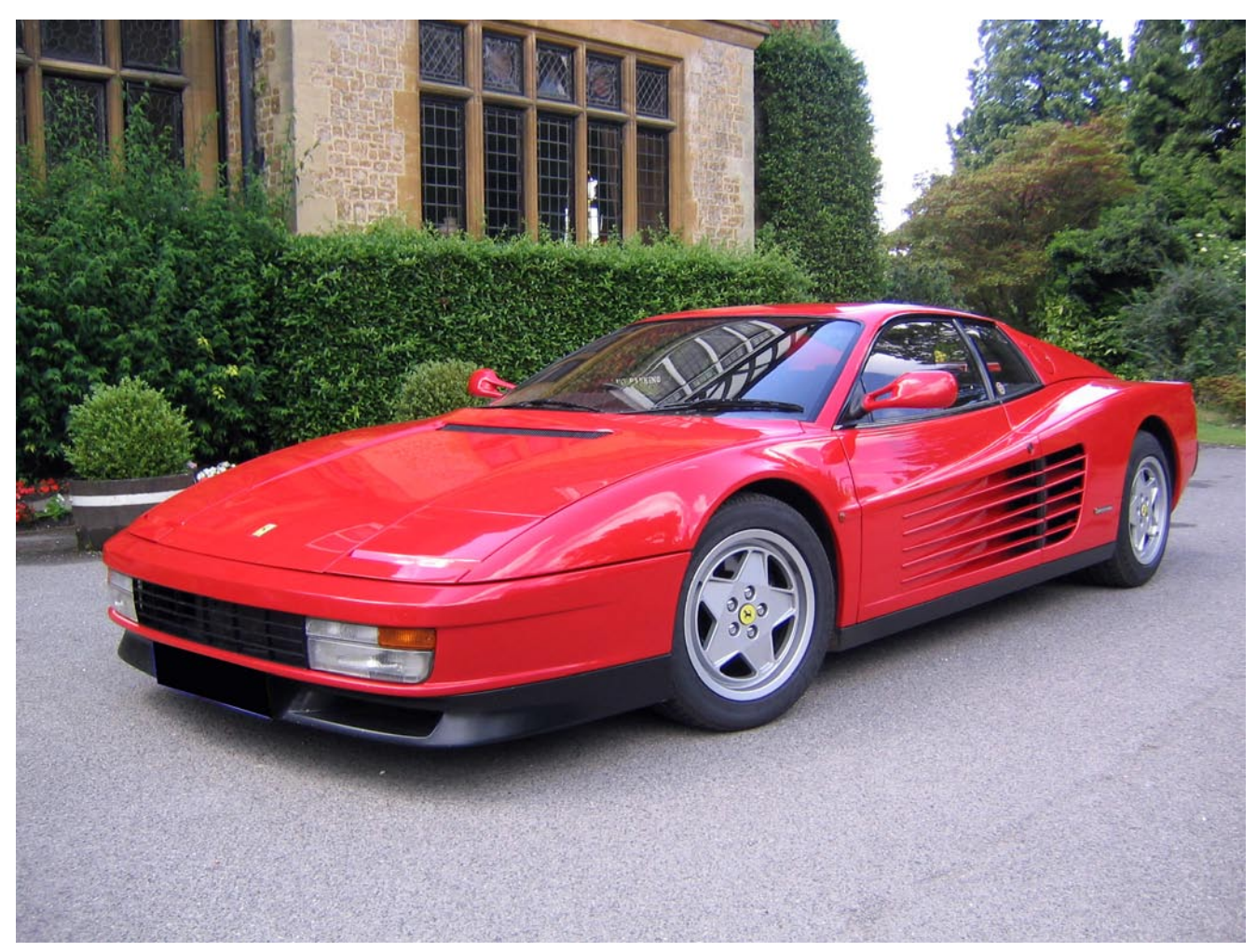
A later model Testarossa is easy to spot. Here is a perfect example as the car has two side mirrors and five bolt wheels.